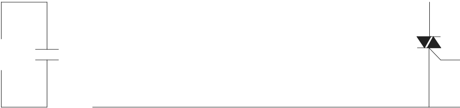
FIG.7 ÖTest circuit for inductive and resistive loads to IEC-61000-4-5 standards