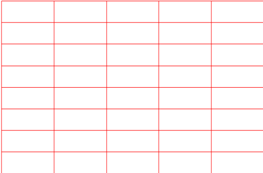
FIG.1: Maximum power dissipation versus RMS on-state current