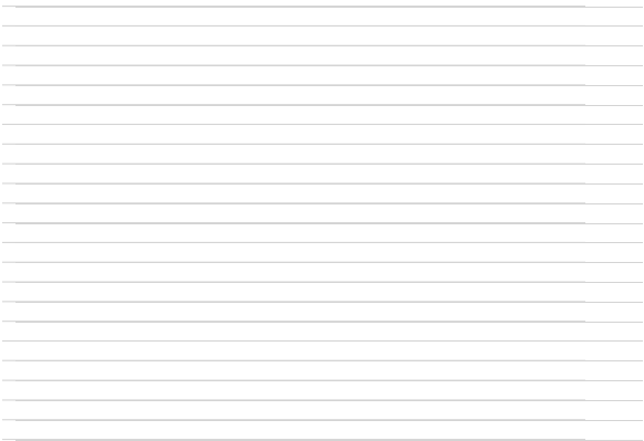
FIG.1: Maximum power dissipation versus RMS on-state current