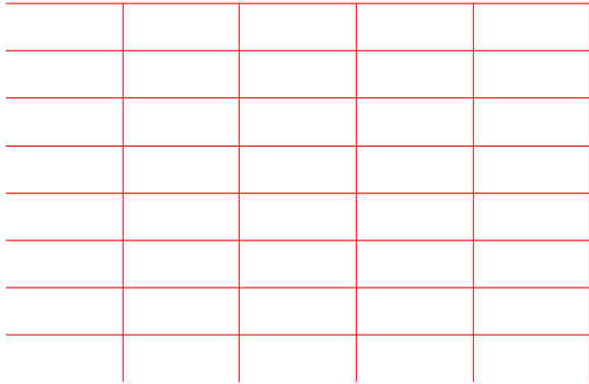
FIG.1: Maximum power dissipation versus RMS on-state current