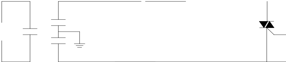
FIG.8 Test circuit for inductive and resistive loads to IEC-61000-4-5 standards