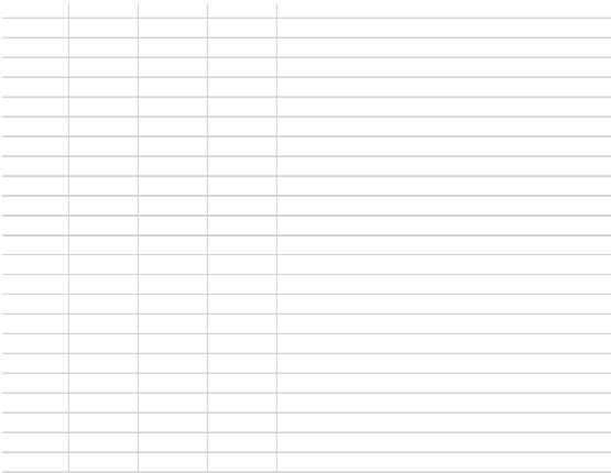
FIG.1: Maximum power dissipation versus RMS on-state current